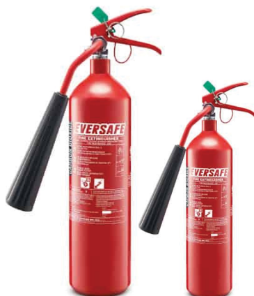
Carbon Dioxide (Co2) Gas Portable Fire Extinguisher