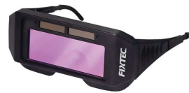
FWG01 AUTO DARKENING WELDING GLASSES

Specifications Lens Colour: Coloured Use: General use Frame & Lens: PCLight weight