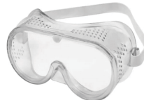
FPSG01 SAFETY GOOGLES - CLEAR WITH STRAP

Specifications Lens Colour: Transparent Use: General use Lens material: PVC