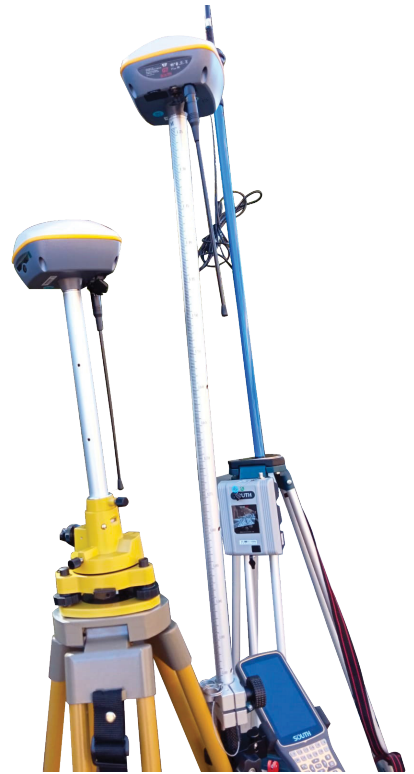
GNSS survey equipment