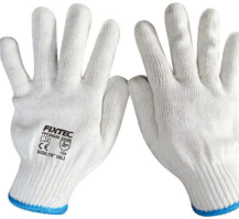
FPCG0620 COTTON KNITTED GLOVES - 10"

Specifications Cut resistant HPPE (high performance polyethylene) safety gloves with polyurethane coating