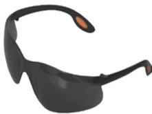
FPSG02 SAFETY DARK GOOGLES

Specifications Lens Colour: Coloured Use: General use Frame & Lens: PCLight weight with CE approval Frame Comfortable To Wear, Wide Visual Field, Impact Resistant