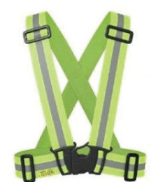
Reflective Safety Elastic Adjustable Vest