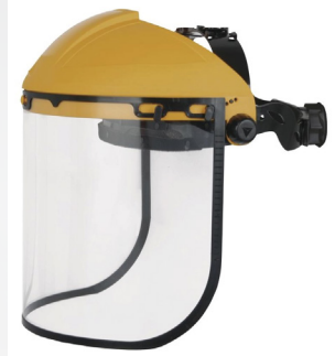
Delta Plus Visor Holder with Clear Polycarbonate Visor