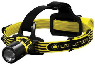
Ledlenser Exh8 Safety Headlight