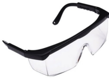
FPSG04 SAFETY GOOGLES - CLEAR (NYLON FRAME)

Specifications Lens: Transparent use: General use with CE approval Frame Made from impact resistant polycarbonate adjustable leg of frame for comfortable use and fit