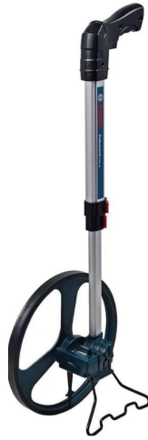
Bosch measuring wheel