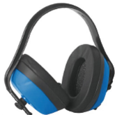
PORTWEST PS48 - SLIM EAR MUFF

Specifications Head Hoop : POM Shell : ABS SNR: 22db NNR: 20db Self Aligning Suspension, easily adju muffs on headband for quick fitting Soft Foam-filled cushion provides good seal for protection against harmful Noise