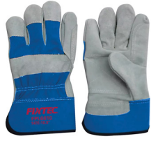
FPLG01 COW SPILT LEATHER GLOVES- 10.5"

Specifications Material: Cotton Disposable: Non-disposable Function: Anti-scratch,anti-static, Heat Insulation