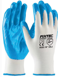
FPNG01 NITRILE GLOVE - 10"

Specifications Material: Cotton Disposable: Non-disposable Function: Anti-scratch,anti-static