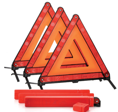
Reflective Safety Triangle