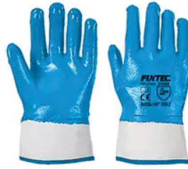
FPLCG01 NITRILE GLOVES - 10"

Specifications Material: Cotton Disposable: Non-disposable Function: Anti-scratch,anti-static, Heat Insulation