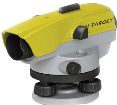
Automatic/Dumpy /Digital Levels