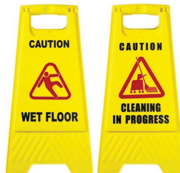
Imec Industrial Floor Signage, 25 Inch