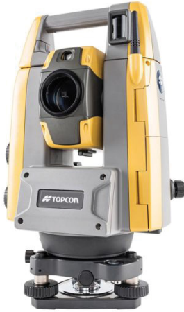
Robotic /Manual Total Stations