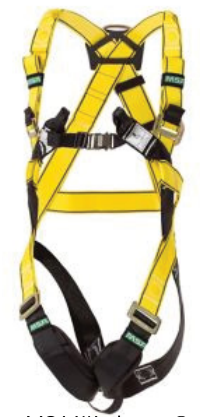
MSA Workman® Premier Harness